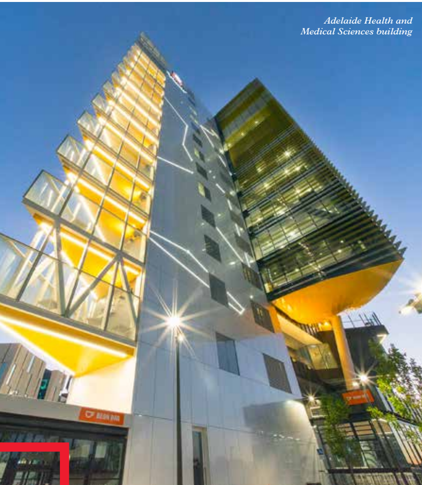
Adelaide Health and Medical Sciences building