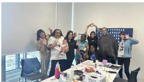
Our team styling it up!