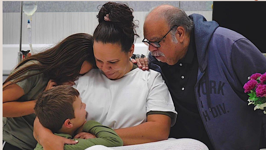
Health Journey Mapping