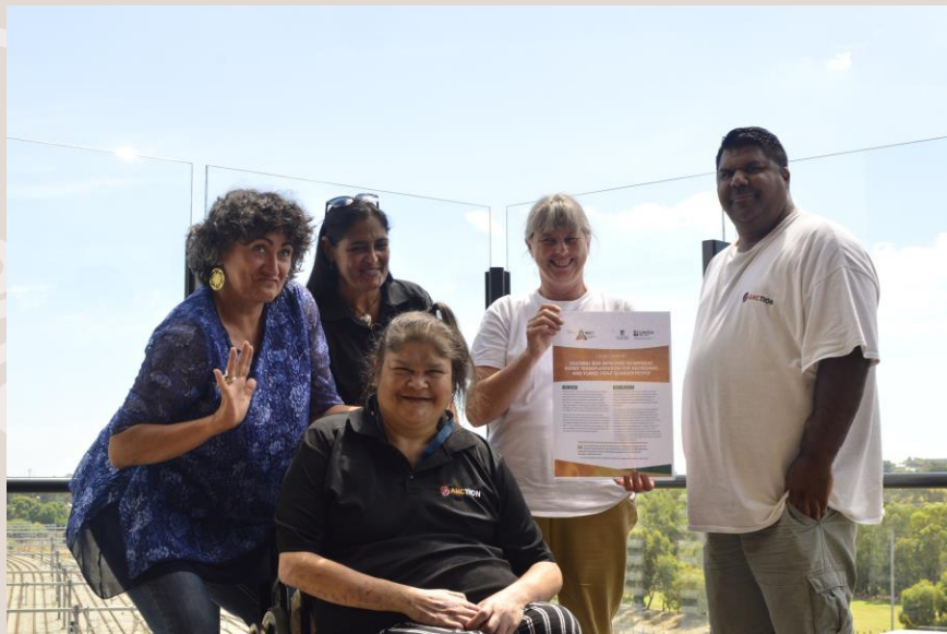
Cultural Bias report