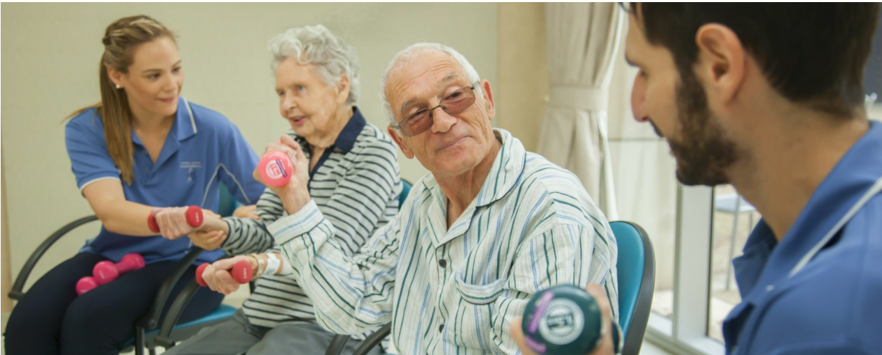
Pictured - Exercise therapy at Geriatric Medicine Unit, TQEH.