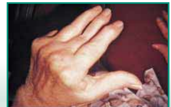
Figure 4: Arthritis makes it difficult to hold a toothbrush

Fluoride treatment stabilises and hardens damaged areas of teeth and roots (see Figures 2 and 3).