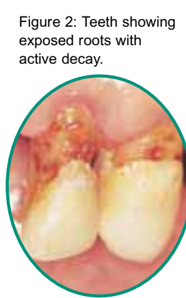
Figure 2: Teeth showing exposed roots with active decay.