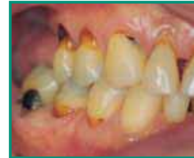
Figure 3: Teeth with root decay.

EVERY TIME we eat or drink our teeth are under attack from ACID produced by PLAQUE BACTERIA.