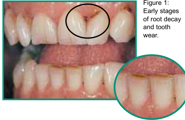
Figure 1: Early stages of root decay and tooth wear.

Perhaps your enjoyment of food has changed, things taste different, or you have developed a 'sweet tooth'. Many of us turn to food when we are bored, worried, less busy or perhaps less happy than previously.