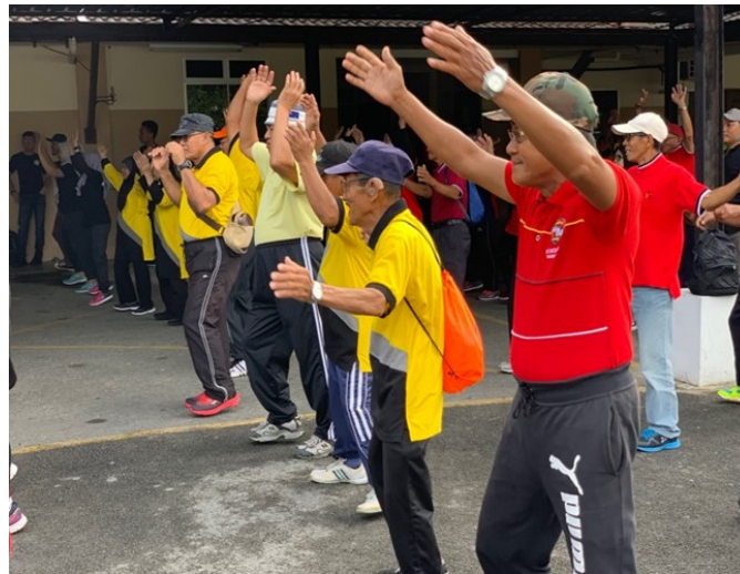
Guests took part in the International Older Persons Day