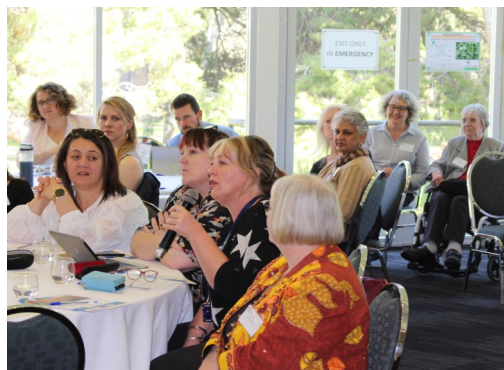
Guest asks a researchers questions during the seminar session.