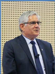
Hon Ken Wyatt AM