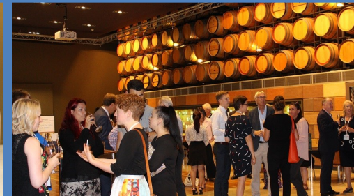
Welcome dinner at Adelaide Wine Centre