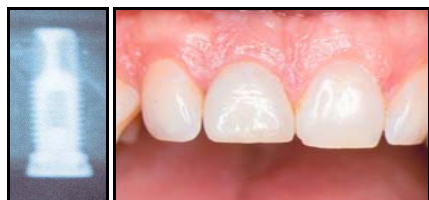
Dental implant - a man made tooth in 8 weeks