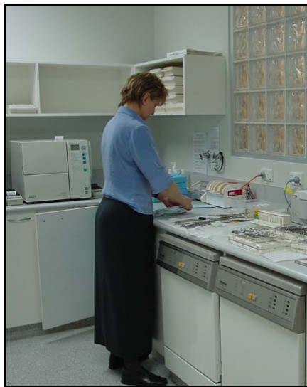
State of the art infection control facilities

Faculty of Health Sciences School of Dentistry