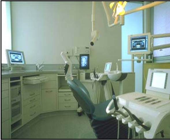
State of the art clinic facilities